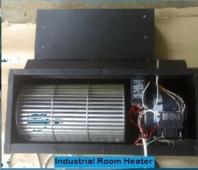
Industrial Room Heater