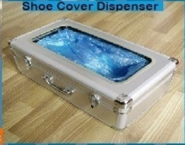
Shoe Cover Dispenser

Since 1978 TRISTAR Serving Customers with Best Satisfaction & Services