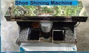
Shoe Shining Machine