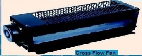
Cross Flow Fan