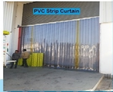
PVC Strip Curtain