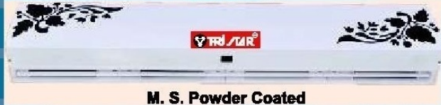
M. S. Powder Coated