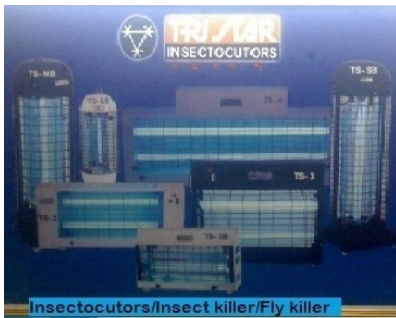
Insectocutors/Insect killer/Fly killer